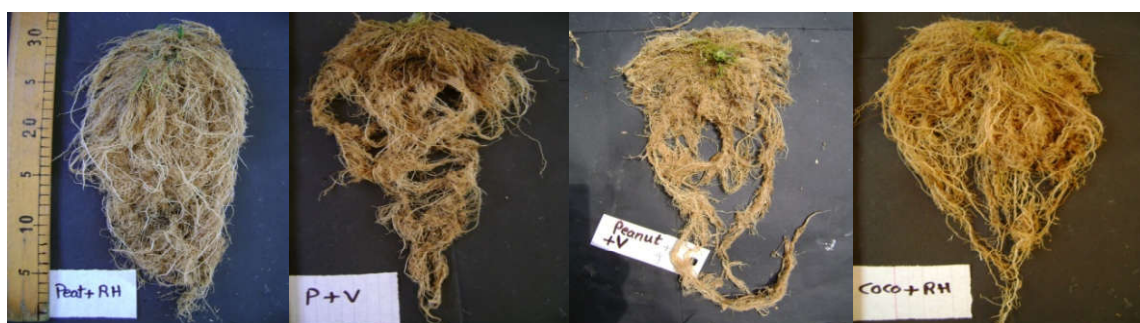
Fig. (2): Root growth pattern in different substrates